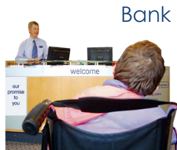
Bank Access to Services