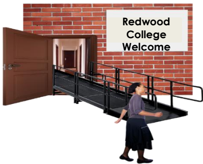
Access to College